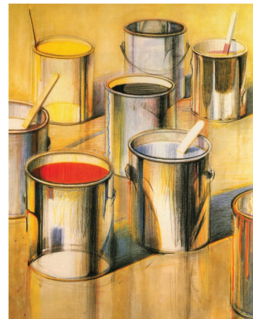
Wayne Thiebaud, Paint Cans , 1990, Color lithograph on wove paper, Photograph by IA&A, © Wayne Thiebaud/Artist Rights Society (ARS), New York

Trade: Matthew's sculptures are primarily made from traditional materials such as bronze, steel, and wood. His motivation and inspiration come from historical and current world events, human interactions, and the way we treat our environment. Tools As Art: Work And Play: Unprecedented in its scope and singular appeal, Tools as Art explores the unsung elegance of tools with sixty-five highlights from the unique holdings of hardware pioneer John Hechinger, toured by International Arts & Artists, Washington DC.